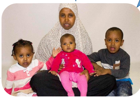
Our life chances will be improved because....

We have fun with our dad at Bookstart corner learning new rhymes and songs, this helps us to develop our language