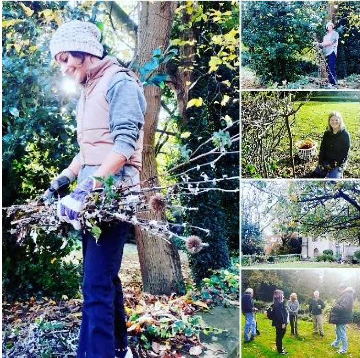
Volunteer gardeners at Bolling Hall Museum.