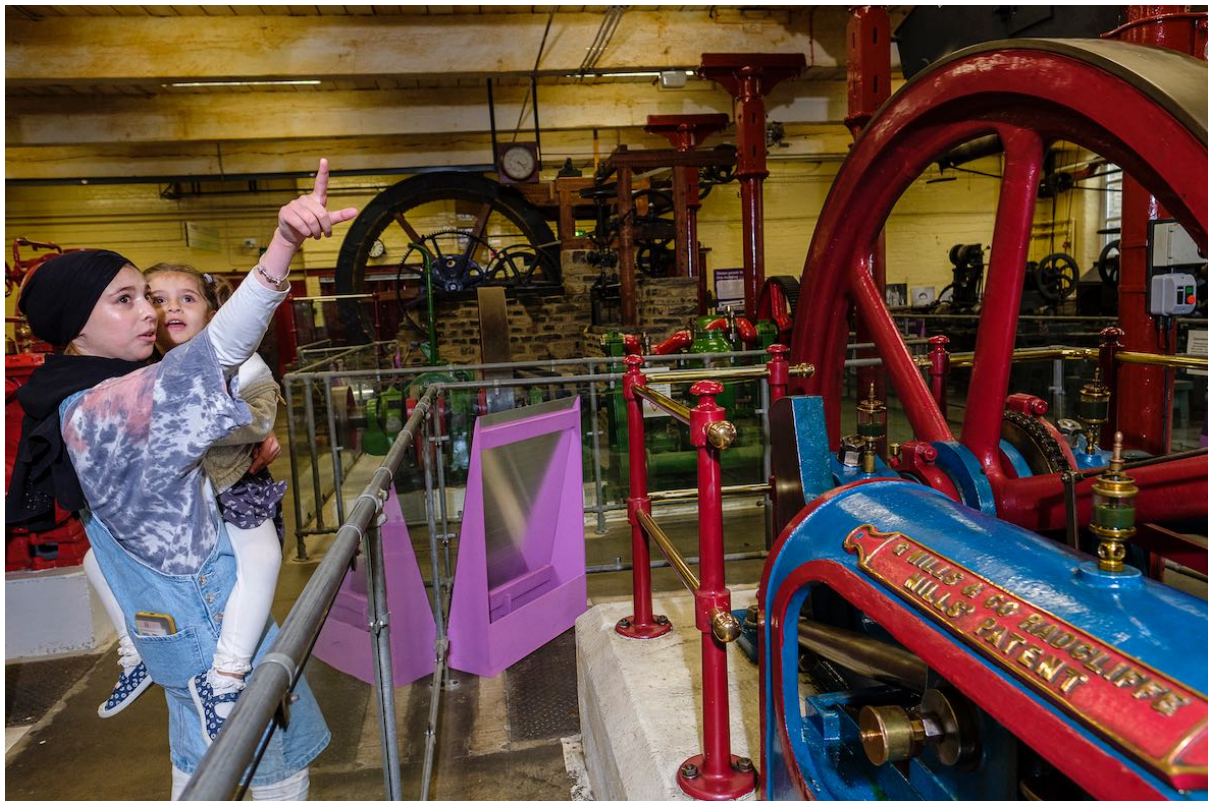
Bradford Industrial Museum tells the district's story of innovation and endeavour.