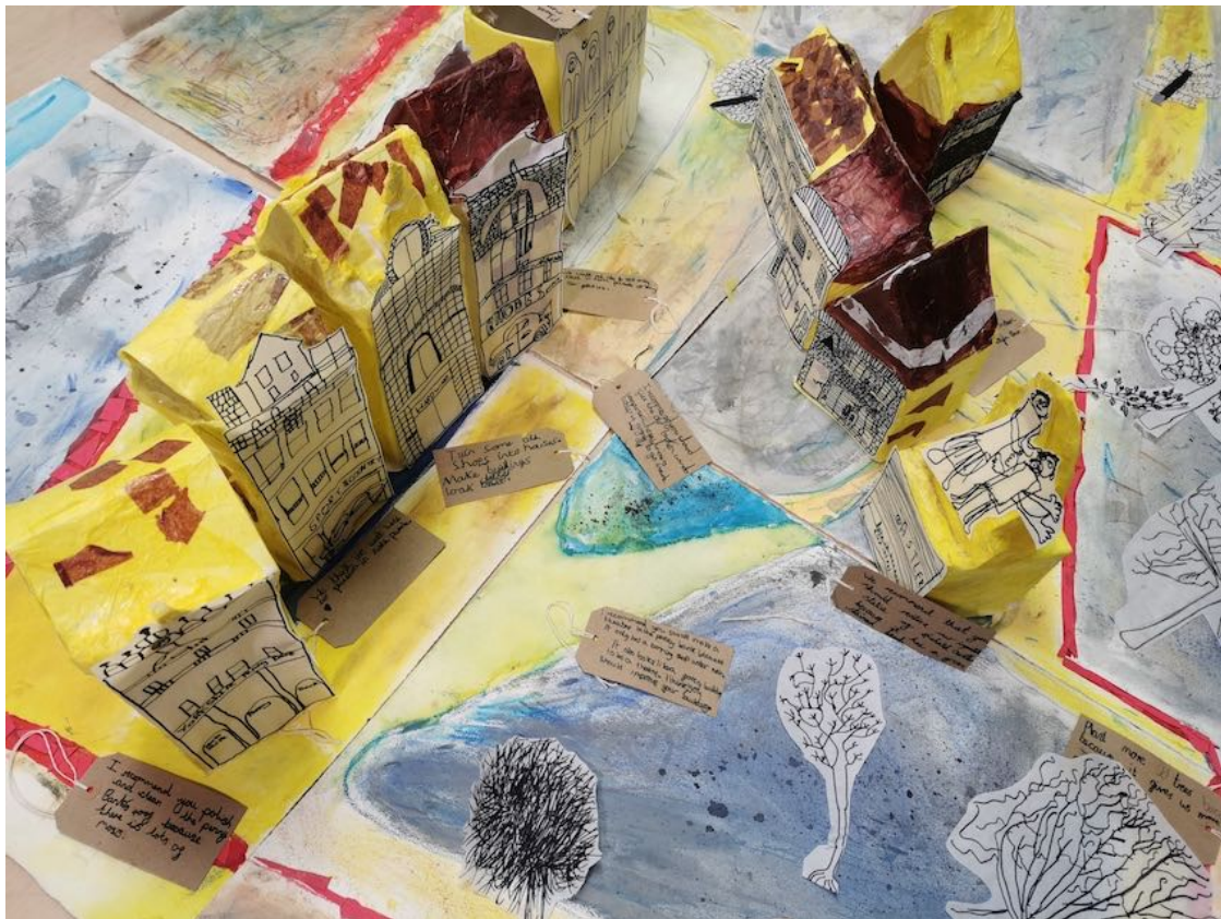
Above: Cartwright Hall reopens after lockdown. Below: Children's art work from the 'Top of Town' project on public display in the Magic Room at Cartwright Hall.