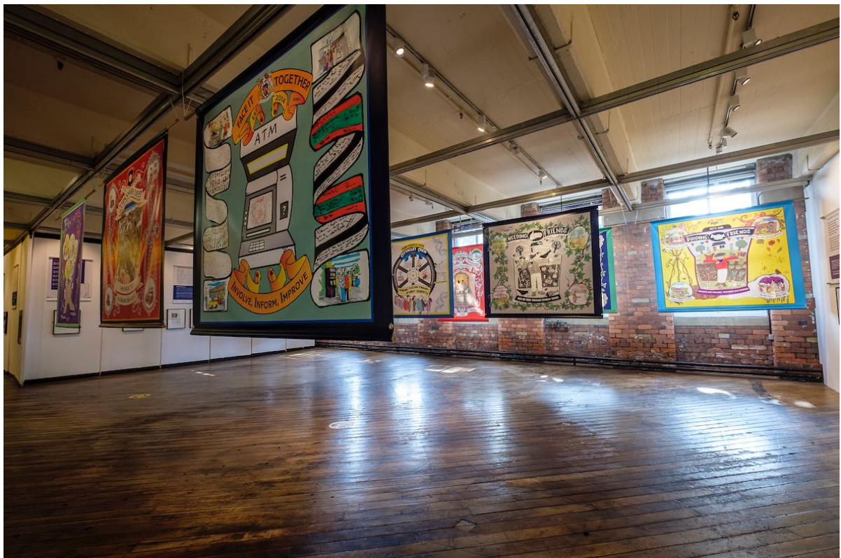
In the 'A Life More Ordinary' project, people living with dementia and their carers worked with artists, designers and poets to create a series of sixteen large banners to campaign for a better understanding and representation of people living with dementia. The banners are on display at Bradford Industrial Museum.