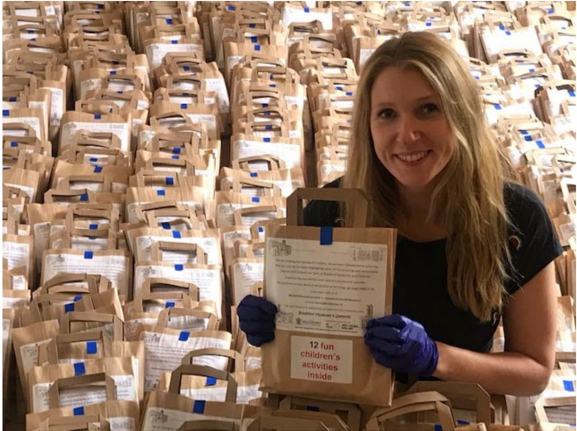
During the summer of 2020 BDMG staff and volunteers distributed 1000 creative activity packs through community hubs and primary schools.