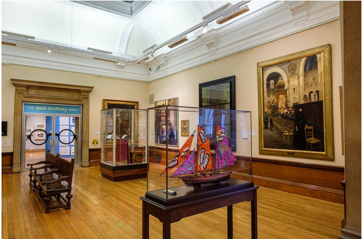
Cartwright Hall shows the work of internationally renowned contemporary artists such as Yinka Shonibare alongside historic works.