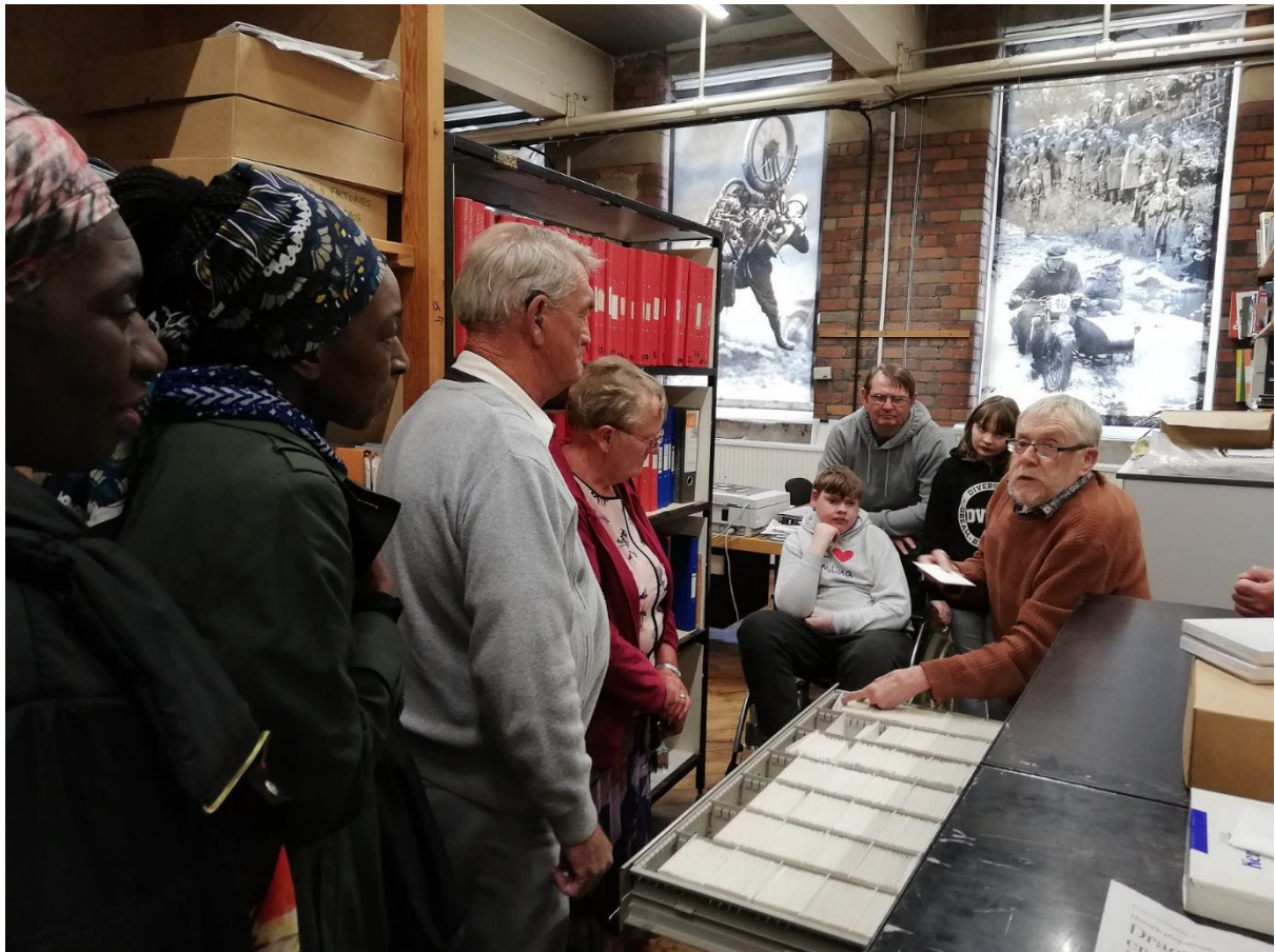
Tour of the Belle Vue photographic collection at Bradford Industrial Museum. Part of a partnership event with the National Science and Media Museum.