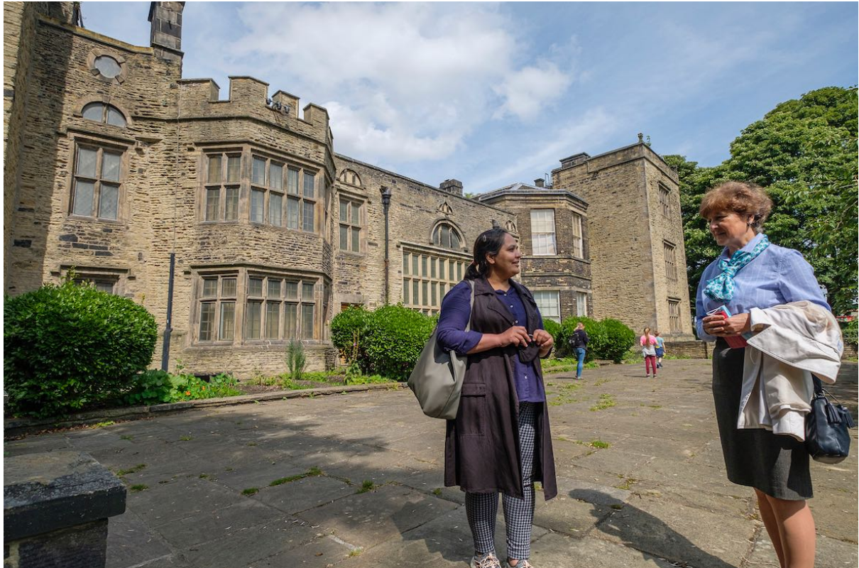
Bolling Hall in West Bowling is one of the oldest buildings in the district