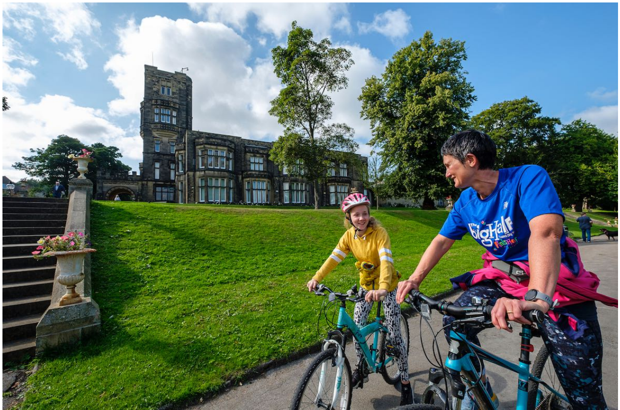
Cliffe Castle Museum in Keighley supports health and wellbeing, connecting visitors with the human and natural worlds.