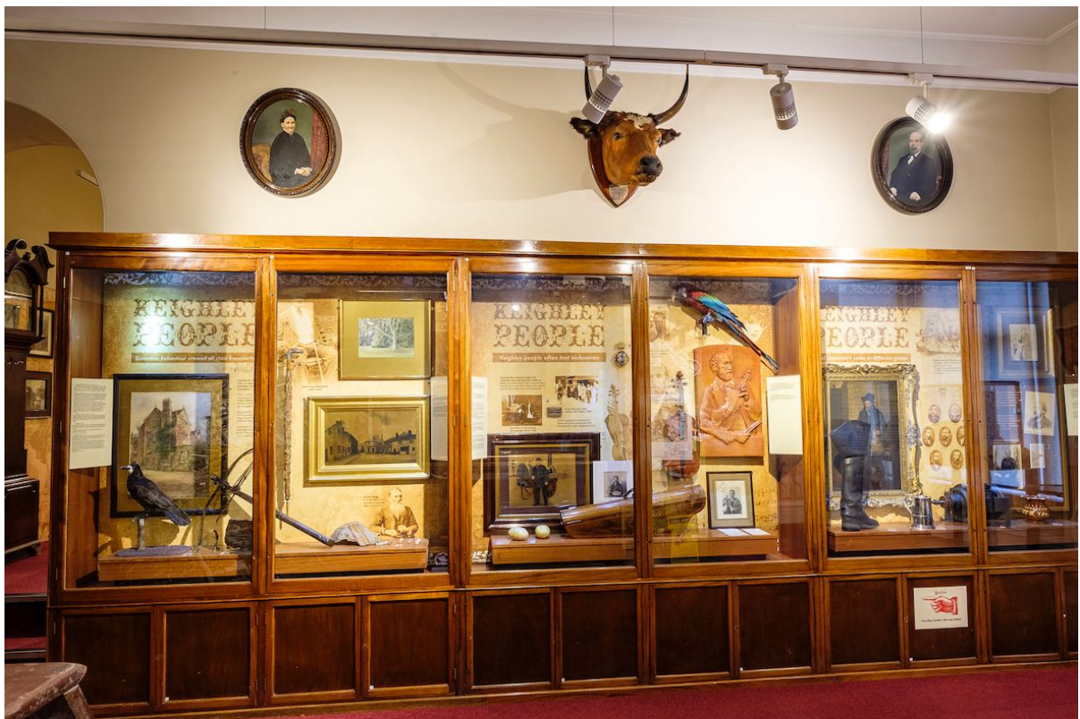
Cliffe Castle captures the unique spirit of Keighley alongside displays of local and natural history.