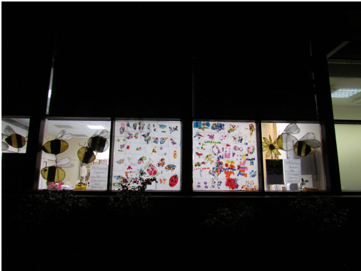
School children and families worked with Cliffe Castle to learn about the importance of pollinators to biodiversity through the museum collection and creative art activities. Part of Keighley Arts and Film Festival, October 2021.