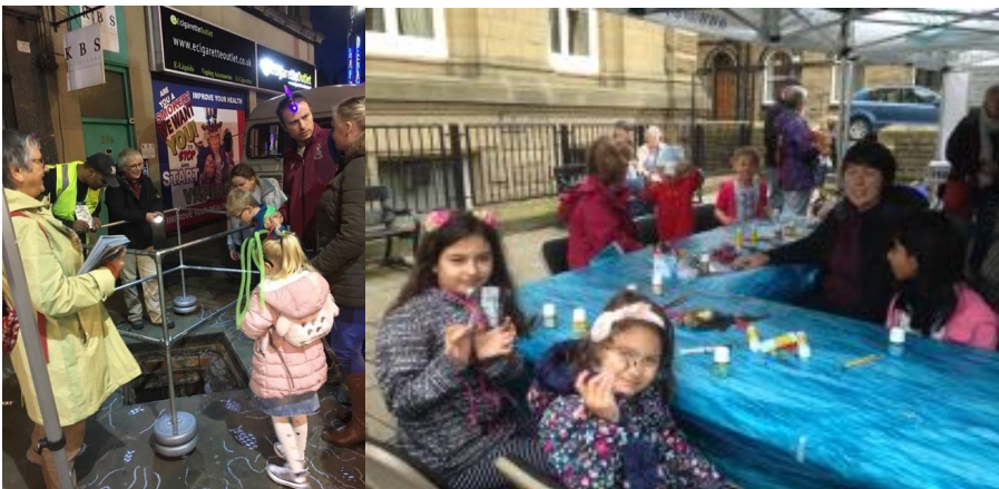
Figure 2 (left) The Beck open in Tyrrel St for the River of Light, and (right) workshop at the Saltaire Festival

Last year, we produced a 32-page booklet with six walks around the becks with the support of the Environment Agency. It includes background on the becks, flora and fauna, and a guide to identifying and reporting pollution. We have distributed about 4000 copies, and still have some left.