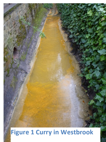
Figure 1 Curry in Westbrook