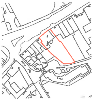
Site Plan, Scale 1:1250