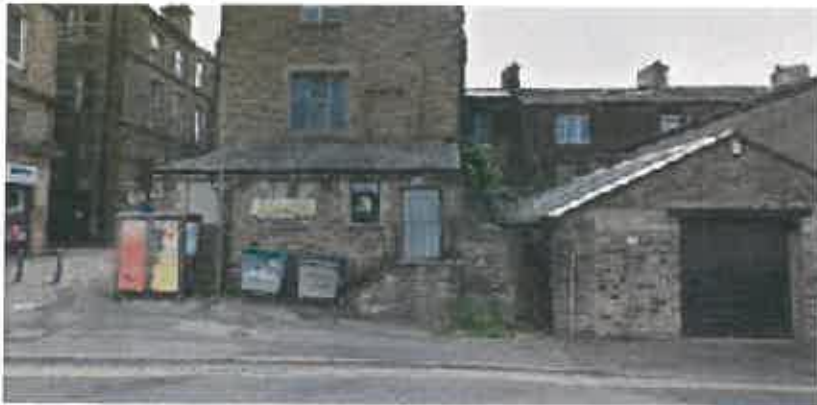
Main St Bingley