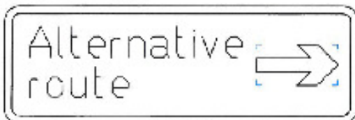
SIGN REF P/3