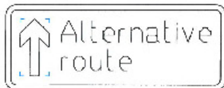
SIGN REF P/2