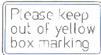
SIGN REF P/6