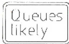
SIGN REF P/5