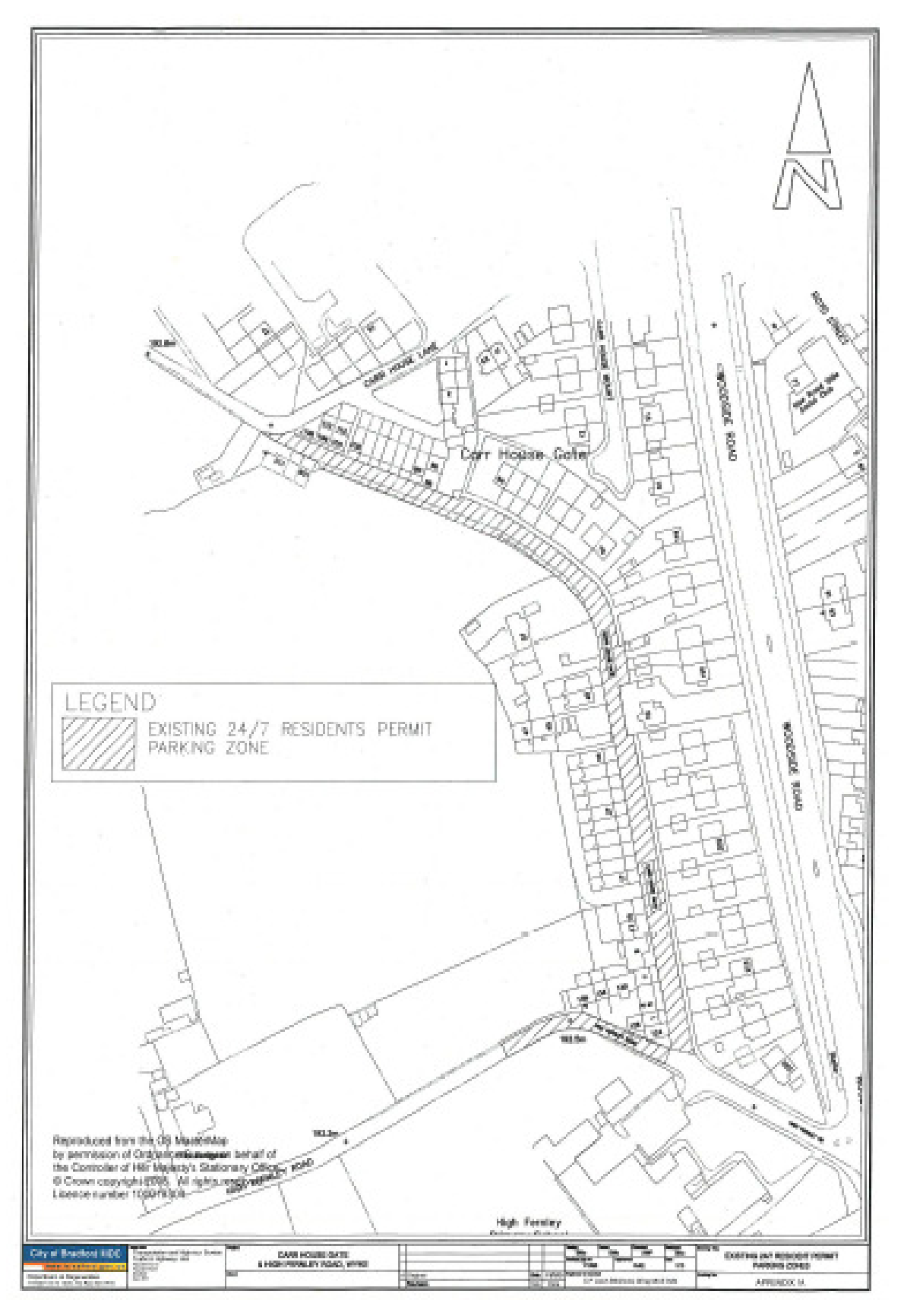
Page 6 of 8